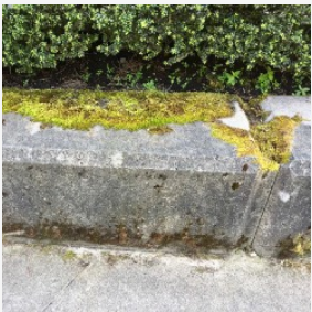
Plant growing on rock or concrete