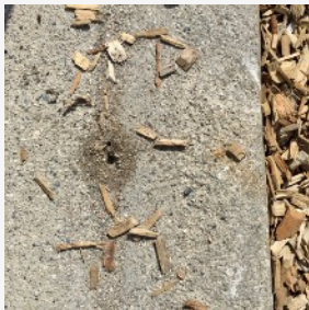
An animal shelter in rock or soil