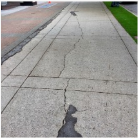
Concrete that has cracked