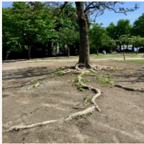
Tree roots that are uncovered