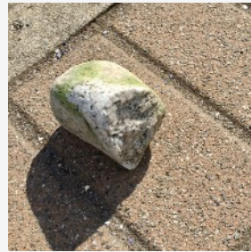
Something hard that has broken